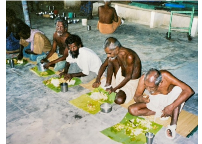
Banana leaves as a plate substitute!

We were privileged on our visit to serve chicken curry and rice to the patients and children. It is served on a banana leaf instead of a plate so there is minimal washing up! Most eat with their hands but many, who have sadly lost most of their digits, strap a spoon to their stump with Velcro!