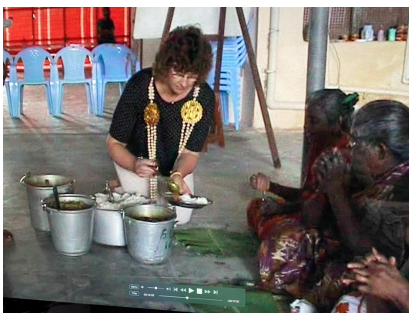
Gen serving chicken curry and rice to the female lepers