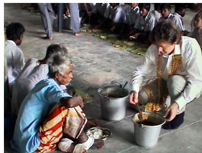
Whilst I served the male lepers