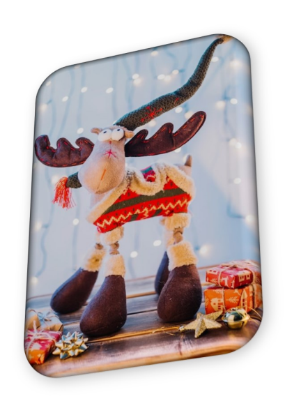
Fun for all the Family!